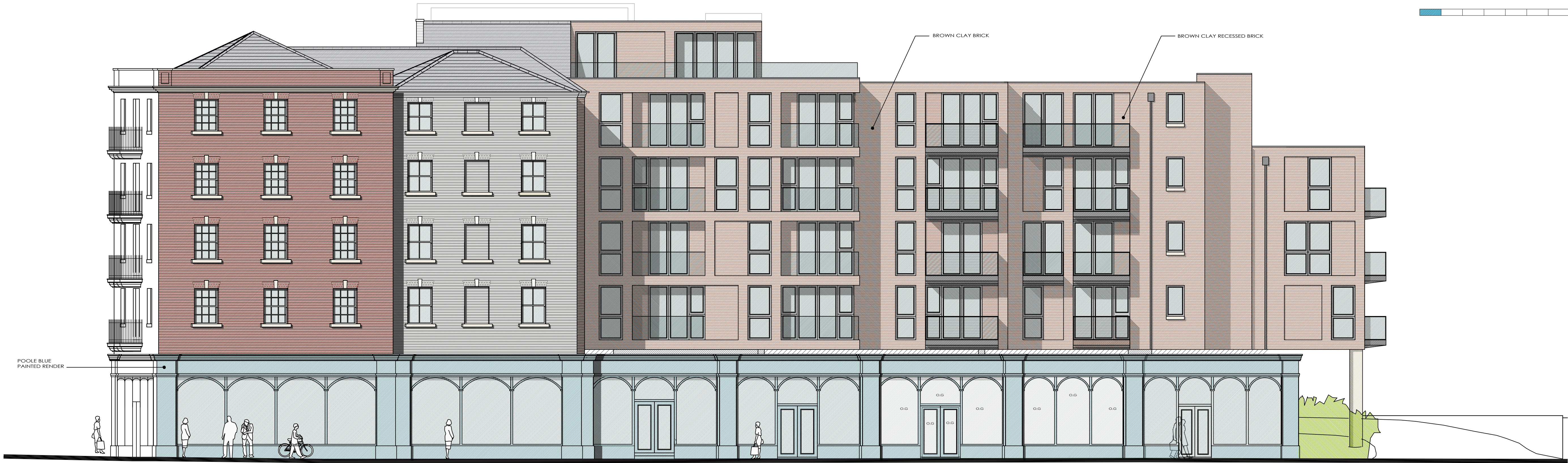
Proposed South Elevation Scale 1:100